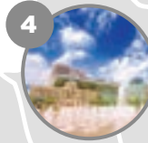
4 City Hall