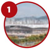
1 World Cup Stadium