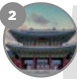
2 The Royal Palace