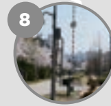
8 Gyeongui Forest Park