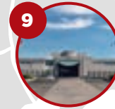
9 War Memorial Complex