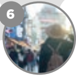
6 Hongdae Street