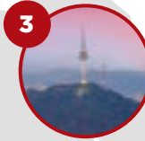
3 Namsan Tower